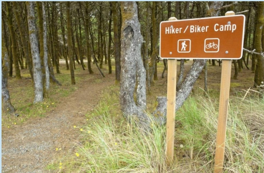
If a campground is full, make sure to let cyclists know that bicycle camping is still available. Also clearly sign the bicycle campsite so they can find it.

In 2016, Oregon State Parks did another survey to see how these new amenities were performing in three specific parks to inform future improvements in other parks and prevent funding unneeded improvements. See page 26 for copies of the survey questions they used on both of these surveys.