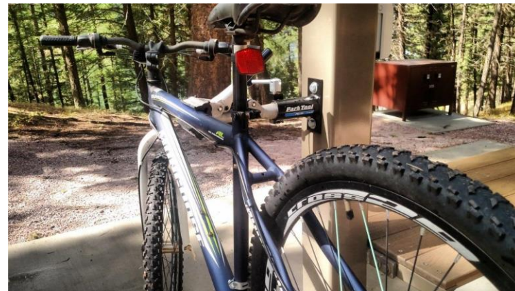
Cyclists set up camp at Beverly Beach State Park in Oregon (left). A bike clamp offers easier bike maintenance at Montana state parks.