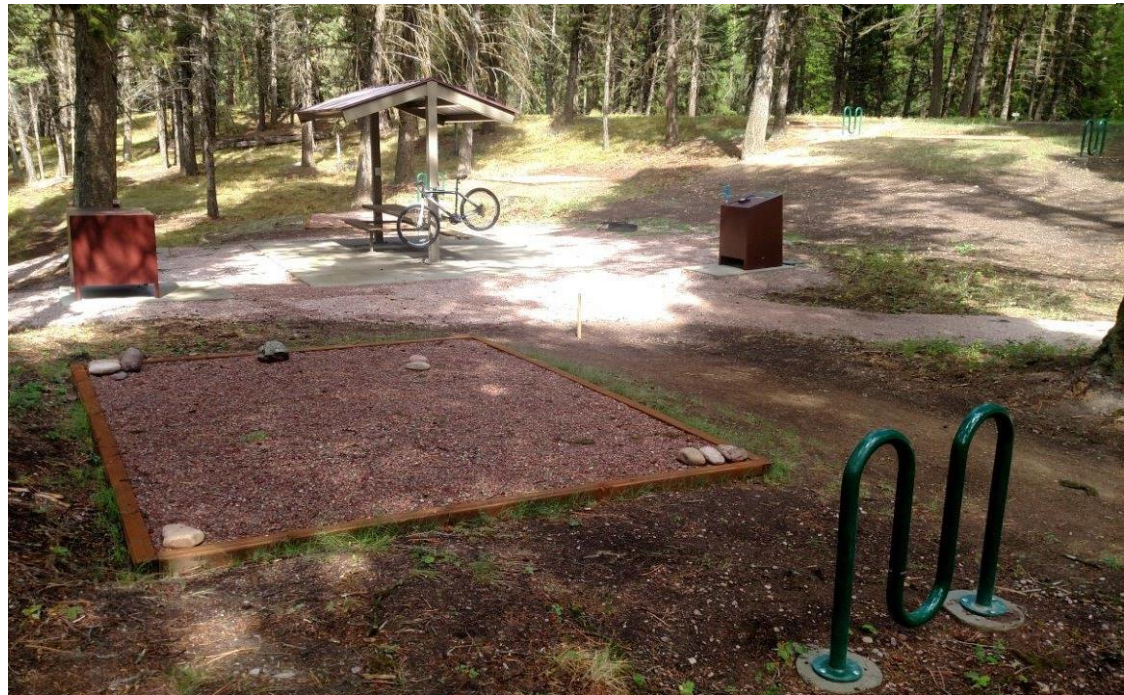
A new hiker/biker site at Salmon Lake State Park in Montana.

Each hiker/biker site included bike racks, bear-proof lockers, a bike repair clamp, electrical outlets, and a covered picnic area. They cost $37,000–$53,000 depending on the site conditions and the extent of work involved. Additionally, instead of charging the usual $18–$28 for tent camping, there is now a specific hiker/biker campsite fee of $6 for residents and $12 for visitors.