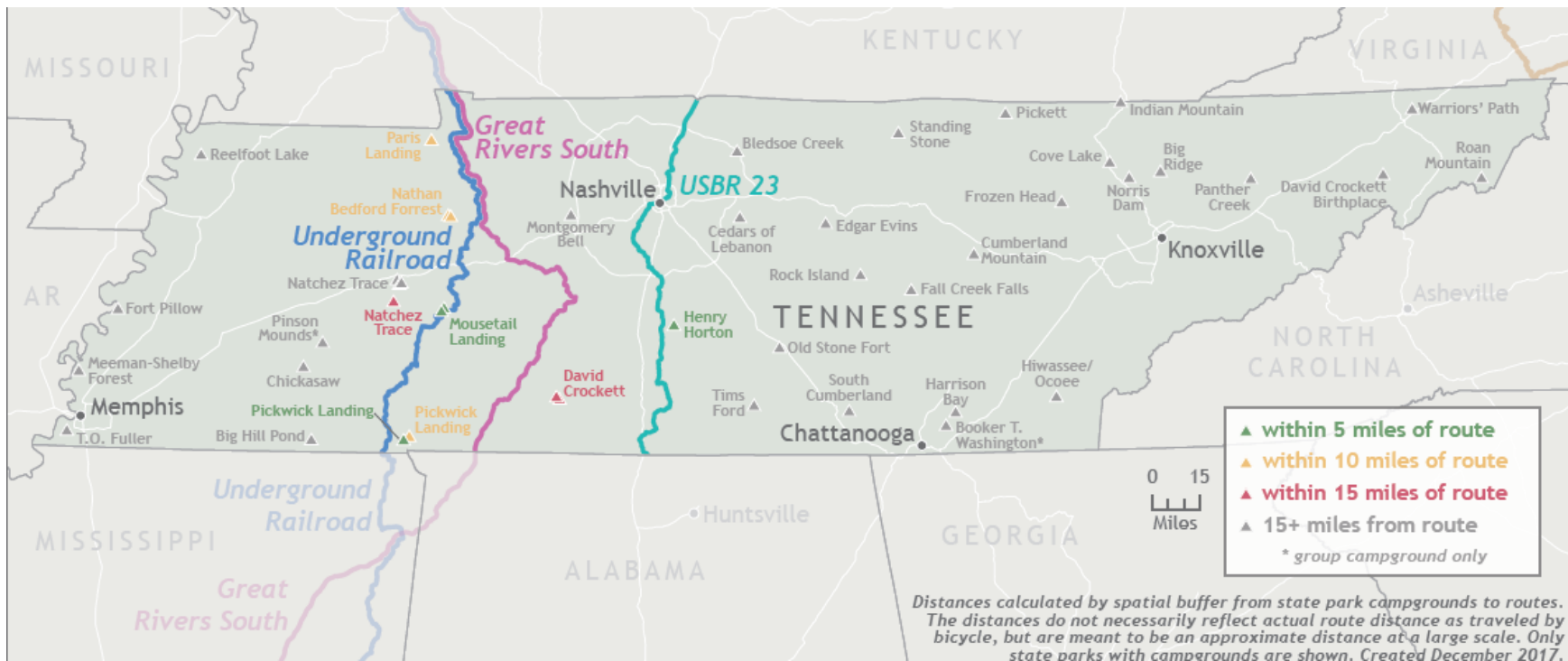
Adventure Cycling created this map to show the proximity of Tennessee state park campgrounds to Adventure Cycling and U.S. Bicycle Routes.

Evaluating your campground's cycling visitation can be difficult if you don't have a way to track it, but a good indicator is whether the campground is in proximity to bicycle routes, whether local, state, or national. Long-distance touring cyclists often follow Adventure Cycling routes, and we can create maps (below) showing which campgrounds have the closest proximity to our routes. Since a five-mile detour results in a 10-mile round-trip ride, that is the maximum distance that cyclists typically go out of their way to get to a campsite. Bicycle camping that is within five miles of Adventure Cycling routes is listed on our maps.