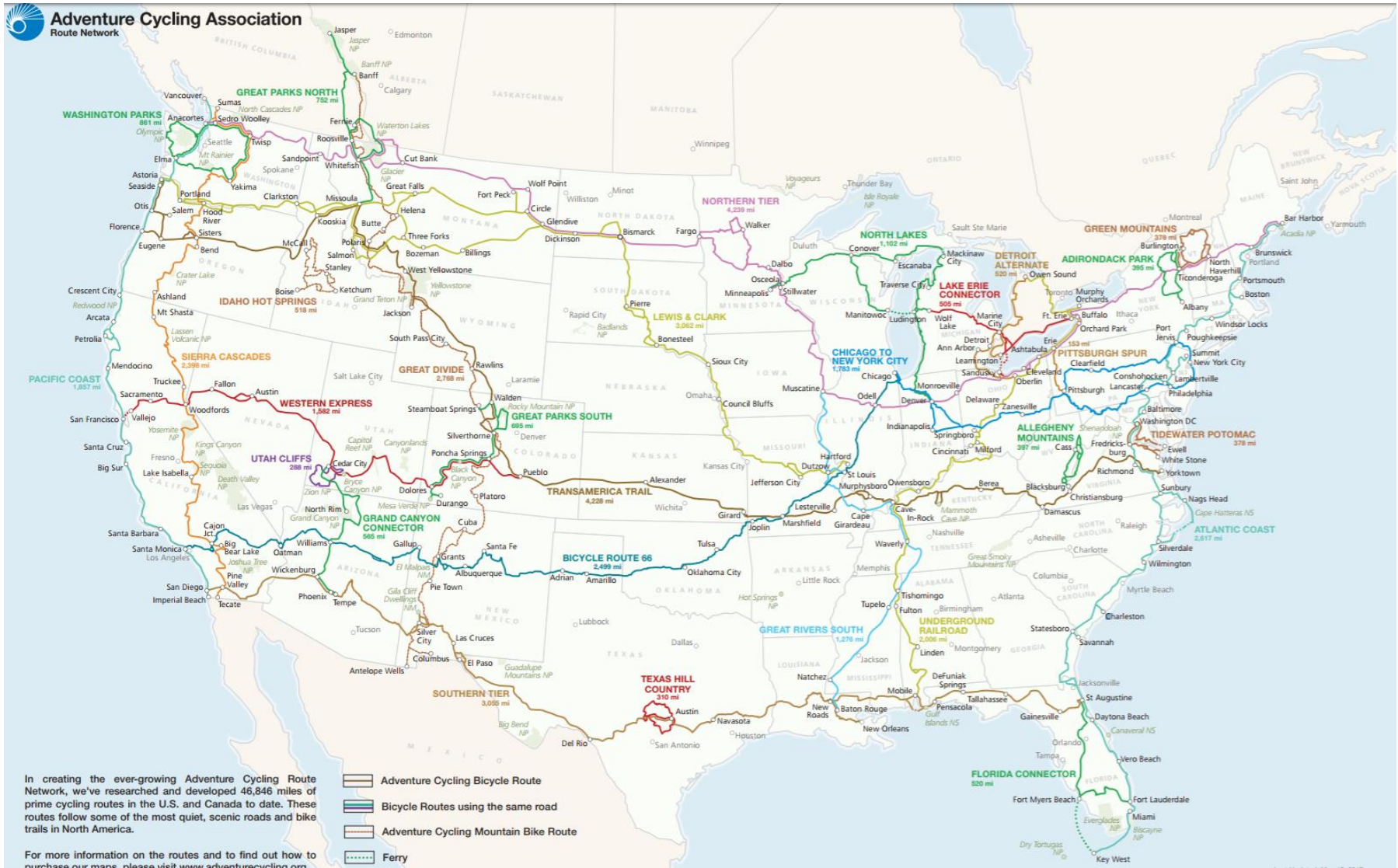
Adventure Cycling's Route Network encompasses over 46,000 miles of mapped bicycle routes. (2018)