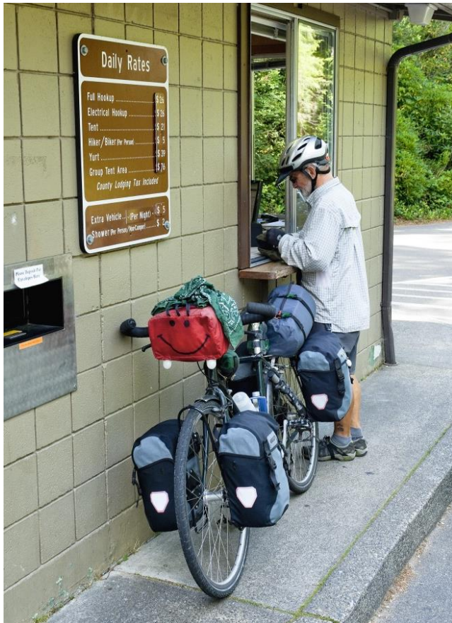
Campers arriving by bicycle pay a $5 fee to use hiker/biker sites at Oregon state parks.

Campgrounds are well equipped to handle motorized visitors and RVs but often don't consider how the needs of non-motorized visitors like bicycle travelers are different. The main challenges that bicycle travelers encounter include: